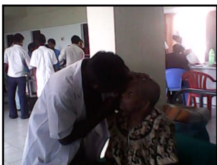
Manakula vinaya hospital, doctors at Tev, checking the elders health condition(OP Treatment)