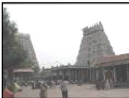
20 elders visit of Thriuvanthipuram temple visit.