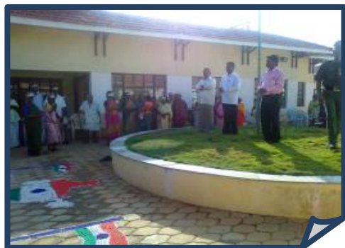
August 15 th 2012 celebrated independence day at TEV.